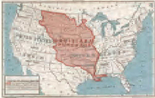
1903 map of the Louisiana Purchase from the U.S. Department of the Interior

In 1803, President Thomas Jefferson completed a treaty with the French government to purchase a large section of land in North America. This land is now known as the Louisiana Purchase. The purchase was important to the future of the U.S. It was the first major expansion of the U.S. since it had won its independence from Great Britain 20 years earlier. The territory gained in the Louisiana Purchase was the largest in U.S. history, totalling 828,000